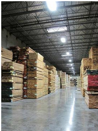
Warehouse Average fixture height 25'

A local contractor and a local distributor recently completed three energy efficient high-bay lighting projects in Kent, Washington using the Aleddra 4-ft LED T8 lamps. The 65,000 ft facility used 400W HID fixtures that provided lighting for both storage and production areas. Providing light levels for safe operation in the production area was important to the overall completion of the lighting project. By replacing 400W metal halide lamp with a combination of 4 & 6-lamp high bay luminaires with occupancy sensors, the energy consumption is reduced to 90W (on average) per luminaire, a 77% saving on energy. According to Brett Hammond, the project manager, the fixtures for the project were pre-wired so that at the job site all that needed to be done was inserting the LED T8 and installing the fixture, drastically reducing the time to just over 3 days. Aleddra LED T8 tube are on Light Design Lab (LDL) qualified LED products list, so the projects qualified for energy rebate from Puget Sound Energy, a utility company in Pacific Northwest. The rebate covers on the average 40% of the project cost, based on 7¢ per KWh saved. For photo gallery of the project, please visit Aleddra Facebook page at www.facebook.com/aleddralighting .