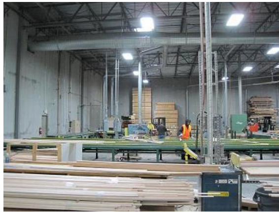
Production Area LED fixtures replaced costly T12's

For more information on the projects and how Aleddra LED T8 tube can help you on your high bay application or any energy efficient lighting retrofit project, contact your local distributors or us at 425-430-4555, or email us at sales@aleddra.com .