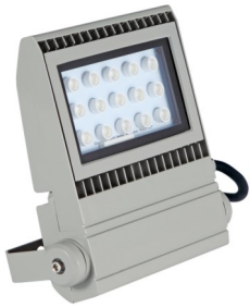
FL220, FL280, FL330