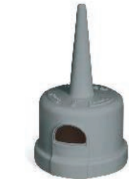
Wireless Controller Lite