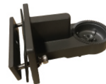
Brakcet-SBL-D2 (For Square Pole)