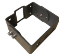
Brakcet-SBL-U2 (For Wall Mount)

The fixture is warranted for 5 years and the LED diode can exceed 100,000 hours.